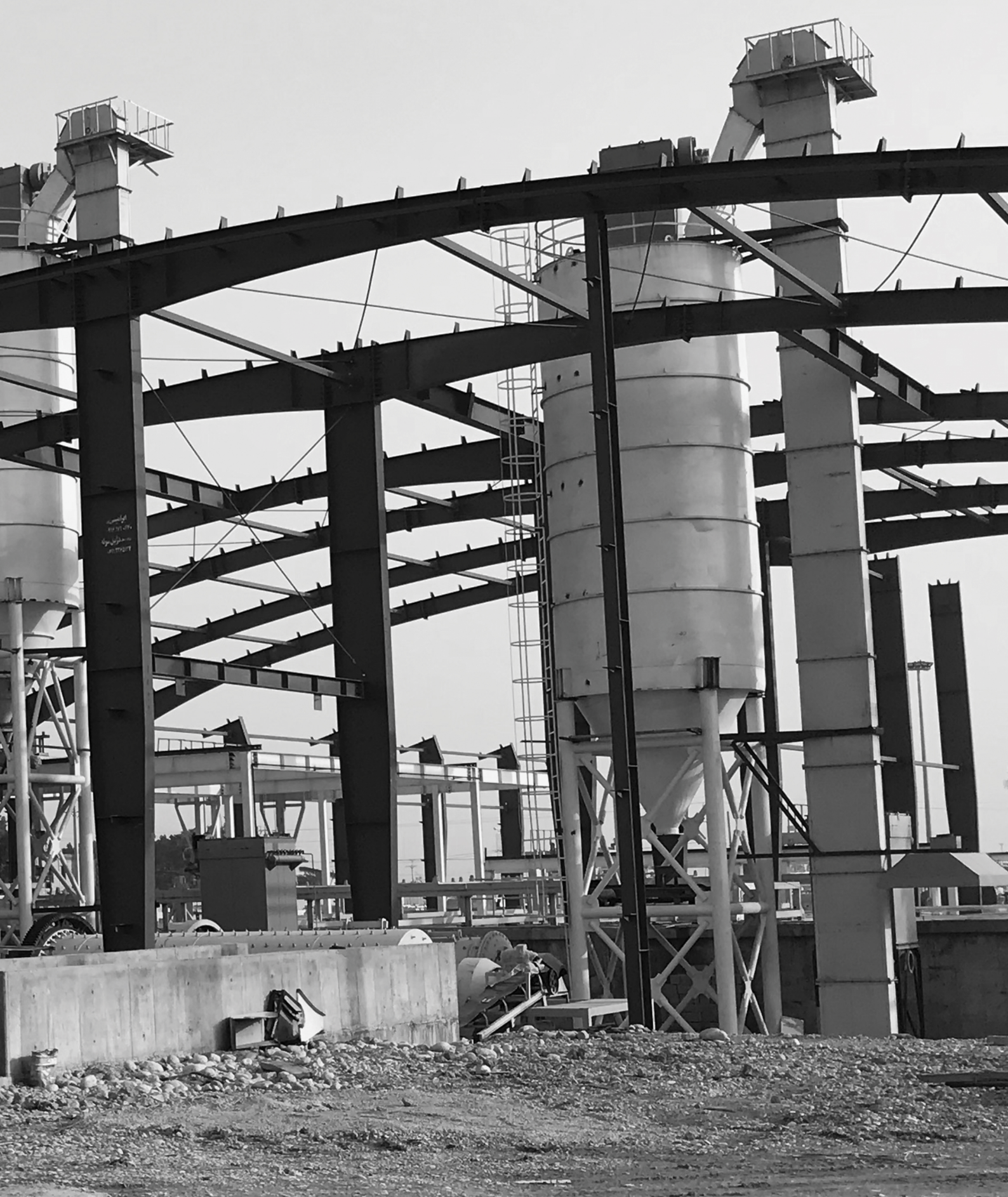
Manufacturer of various metal structures and niches